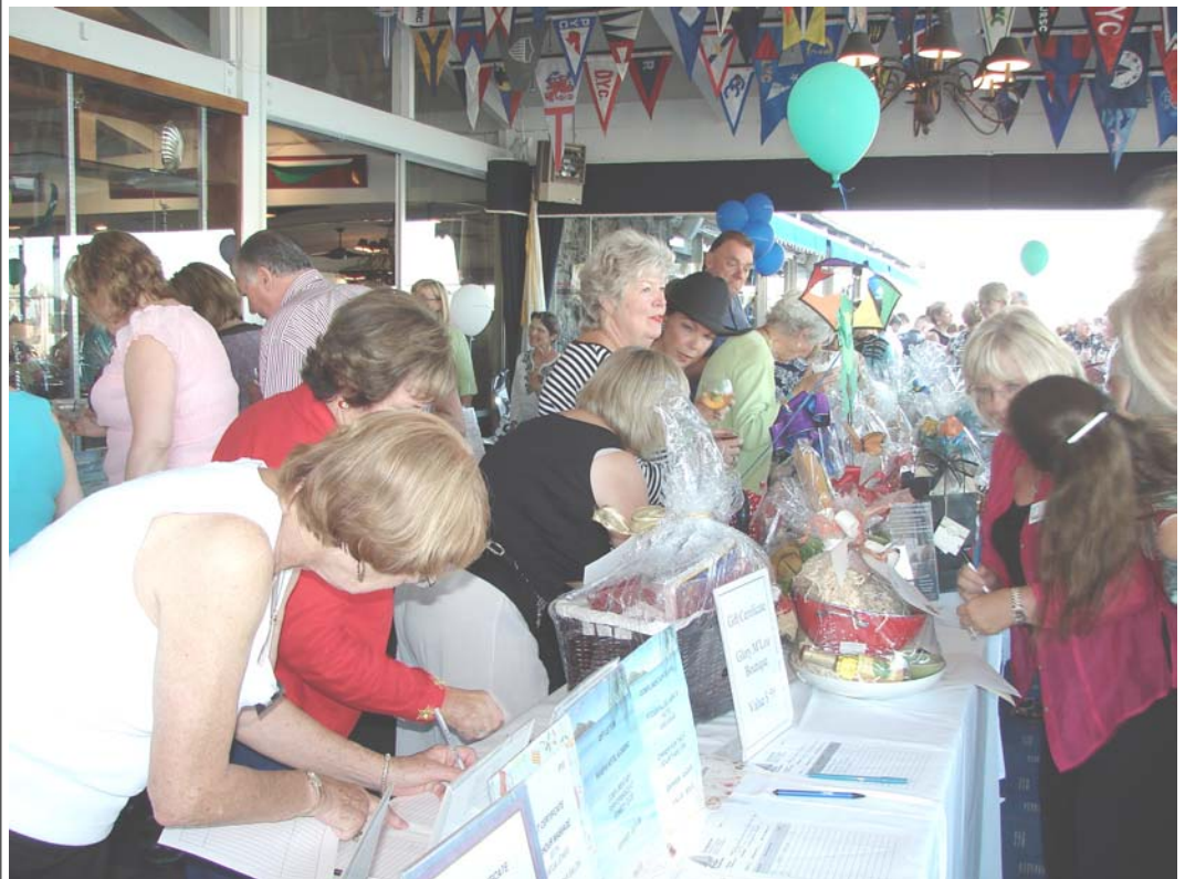
Going, Going, SOLD! - Attendees bidding on silent auction items.